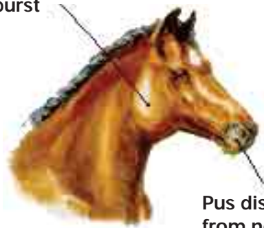
Pus discharge from nostrils

Typically, horses suffering from strangles have pus discharging from the nostrils and swellings (abscesses) forming in the lymph glands under the jaw. These abscesses often burst and exude a thick yellow pus. Affected horses can have fever, be depressed and may stop eating.